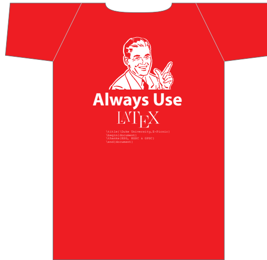
STANDARD MEDIUM T-SHIRT BACK Imprint Size: 10.5" wide (approx)