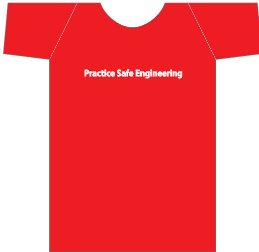
STANDARD MEDIUM T-SHIRT FRONT Imprint Size: 10.5" wide (approx)